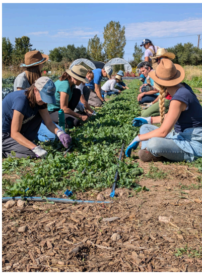
Reunity Resources (Santa Fe)