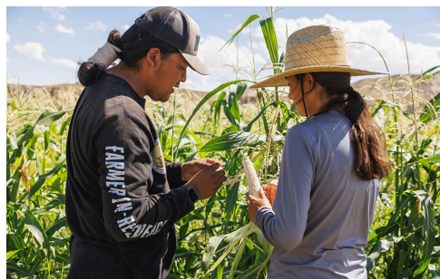
Bidii Baby Foods (Shiprock)