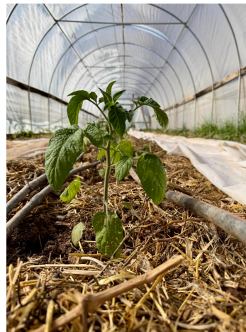
HawkMoth Farm (Anton Chico)