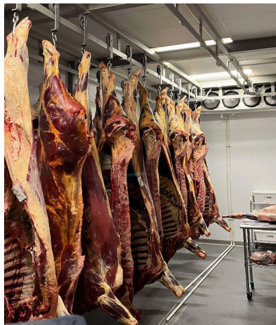
C4 Enterprises, Inc. (Tierra Amarilla)