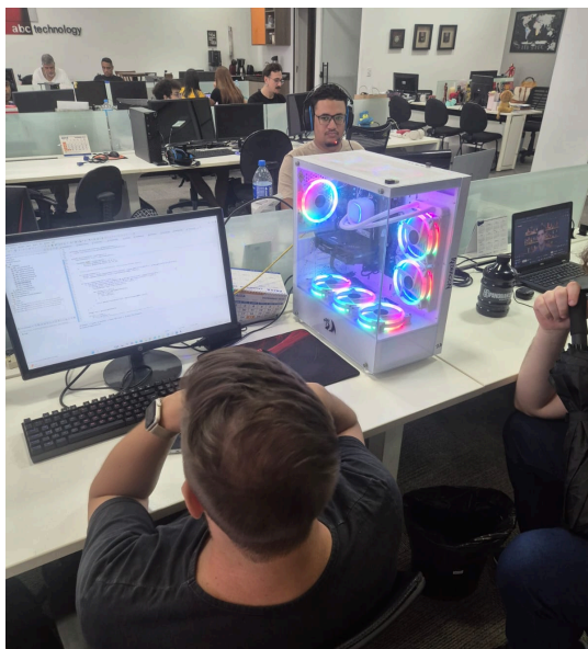
In 2025, ABC Technology Group selected Albuquerque as the location for the next phase of its U.S. expansion. Pictured above: Employees at the ABC Technology office.