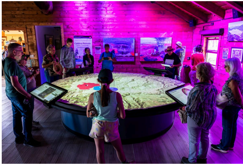
Ideum, Inc. has been based in Corrales for two decades. Pictured above: Ideum interactive projection display at Valles Caldera.

EDD's mission is to improve the lives of New Mexico families by increasing economic opportunities and providing a place for businesses to thrive. EDD's programs contribute directly to this mission by funding workforce training and infrastructure that supports business growth, helping every community create a thriving economy.