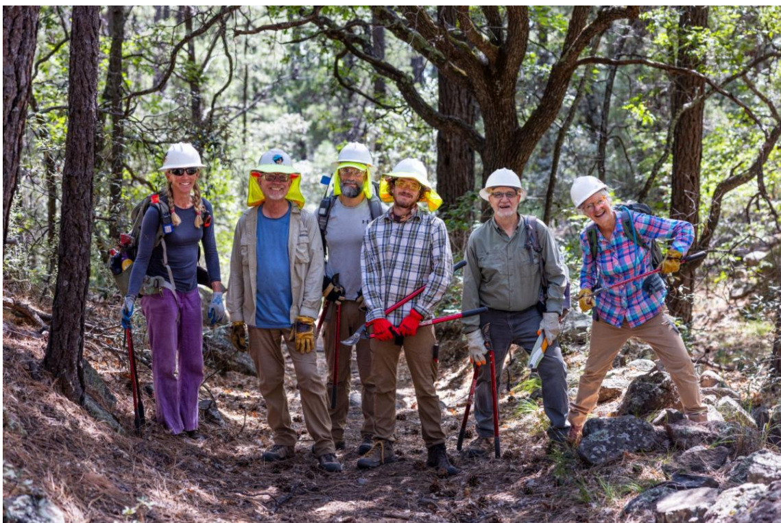
Gila Chapter Back Country Horsemen of New Mexico will improve equine access in the Gila National Forest.