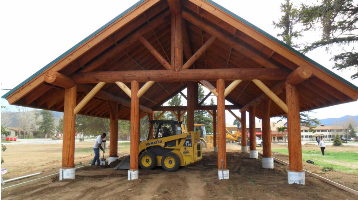
Village of Eagle Nest will add ADA access to their pavilion at Enchanted Eagle Park.